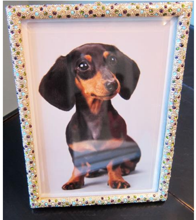
Just in case you missed it: The regal portrait of Sanders's mini-dachshund, Bailey, graces a bedroom side table.