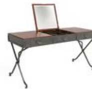
The Bascule Dressing Table Soane Britain