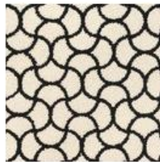
Interlace Rug Merida