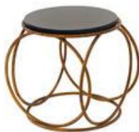
The Velo Low Table Soane Britain