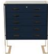
Stamboul Valis & Mirror STC