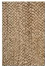
Bora Bora Rug Merida