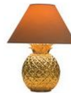
The Pineapple Table Lamp