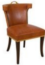
The Casino Chair Soane Britain