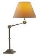
The Articulated Desk Lamp Soane Britain