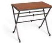
The Cavaletti Table Soane Britain