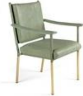
The Crillon Dining Chair Soane Britain