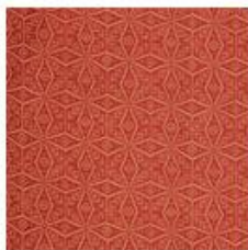
Kaleidoscope Soane Britain