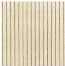
Pinstripe Rug Merida