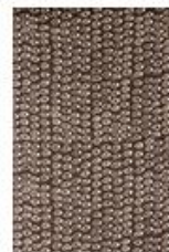
Paw Print Soane Britain