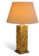
The Grissini Lamp Soane Britain