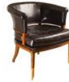
The Quiver Klismos Chair Soane Britain