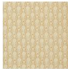
Pineapple Silhouette Soane Britain