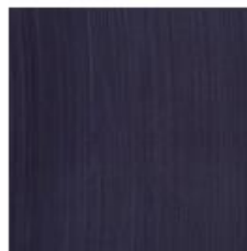
Horsehair Soane Britain