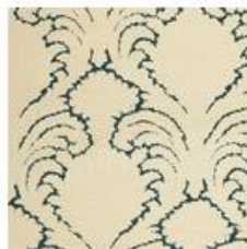
Pineapple Frond Soane Britain